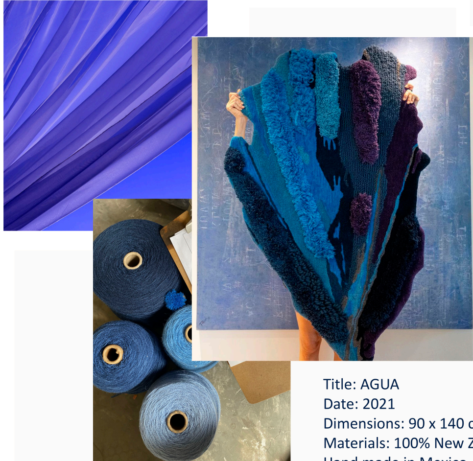
Title: AGUA Date: 2021 Dimensions: 90 x 140 cm ( 36 x 55 in.) Materials: 100% New Zealand Wool Hand made in Mexico Price: $2000 USD