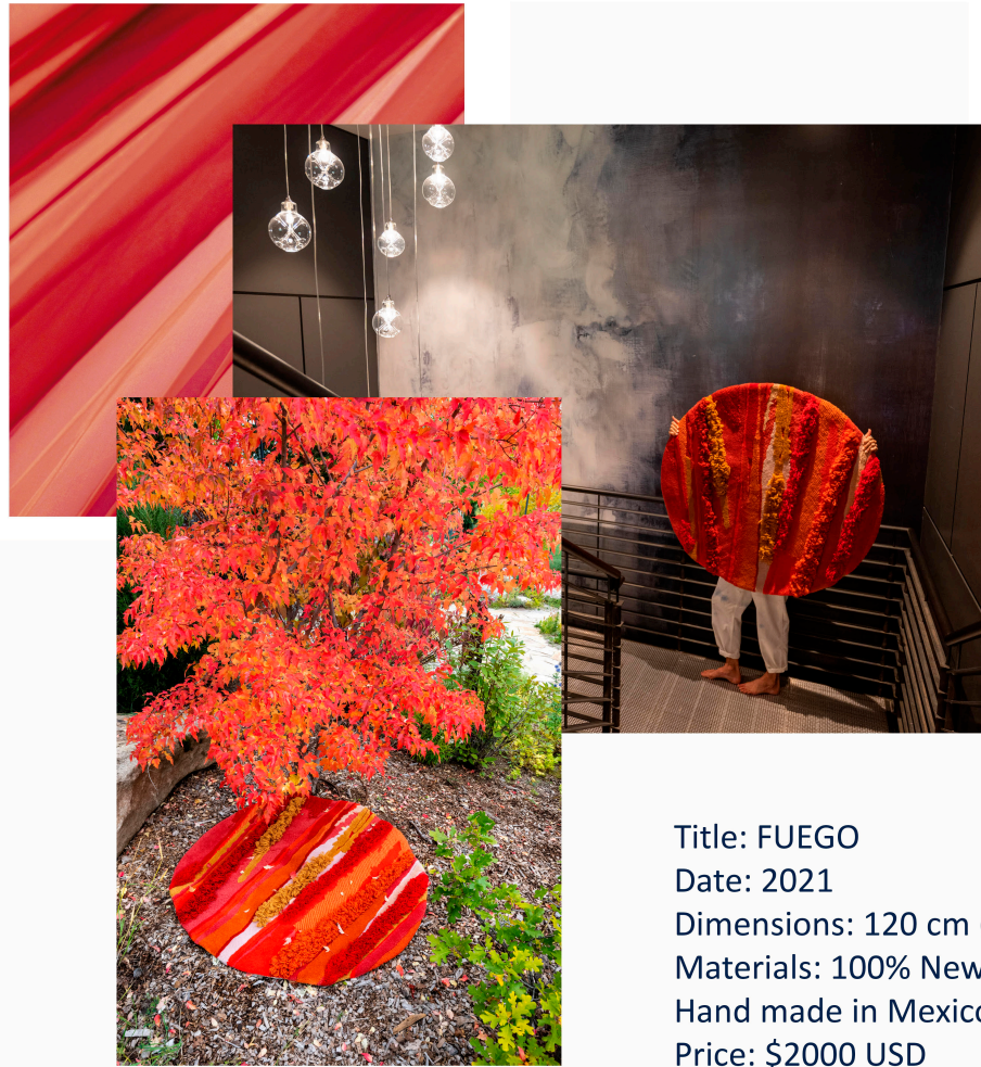
Title: FUEGO Date: 2021 Dimensions: 120 cm ( 47 in.) Materials: 100% New Zealand Wool Hand made in Mexico Price: $2000 USD